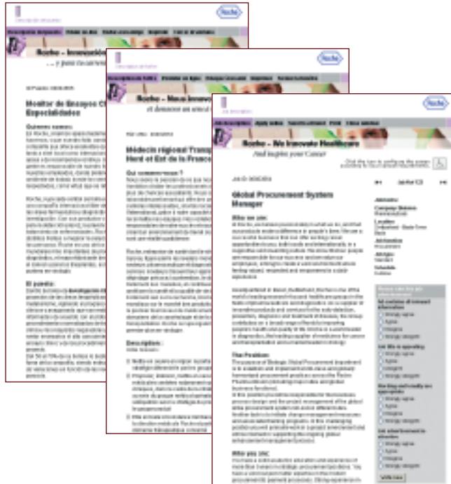
Uniform implementation of the Roche employer brand on the career websites of various international branch operations

Based on a service-oriented architecture (SOA), BeeComeOne® is able to assume the mapping and storage of data from dissimilar systems. Special web services and transformation procedures guarantee uniform depiction of job data on a variety of channels. BeeComeOne® is HR-XML-certified, falling back on the HR-XML standard SEP 2.2 for the exchange of HR-relevant data.